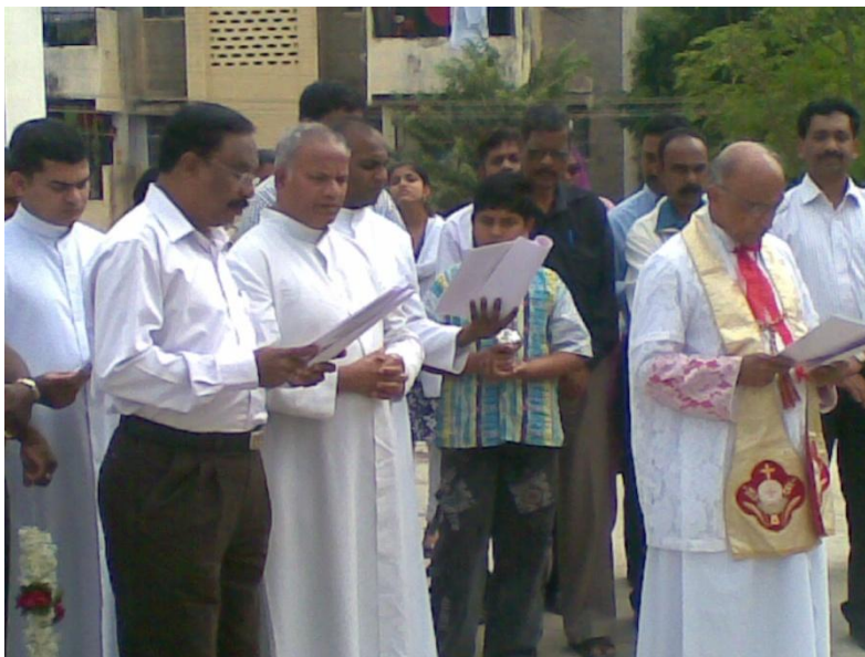
The former parish council member (present construction committee member) reads a passage for the blessing ceremony (St. Peter's Church, Rustambagh)