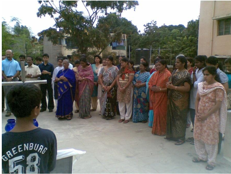
A part of the faithful gathered at the time of blessing of the site, St.Peter's Church, Rustambagh