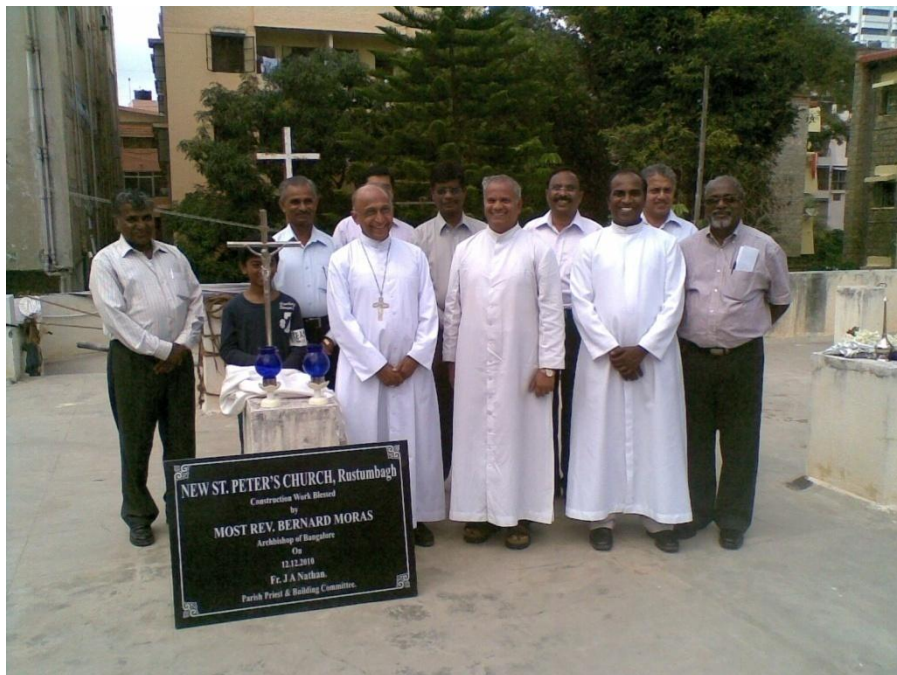
Archbishop Bernard Moras with Parish Priest Fr.J.A.Nathan and others during the blessing of the site for the new Church building, St.Peter's Church, Rustumbagh

The additional church building comes up on the terrace of the present structure, St.Peter's Church, Rustumbagh, The Archbishop is blessing the site